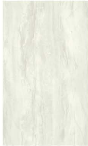
SUFORMA - VENETO CRYSTAL F2309