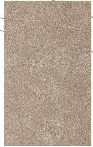
SUFORMA - COLORADO FCOLO1