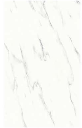
SUFORMA - MARBLE BIANCO F9058