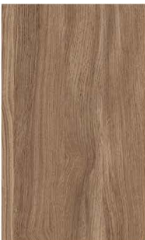
SUFORMA - TIMELESS OAK COCOA M6285