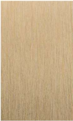
SUFORMA - GOLD ALUMINIUM L5004