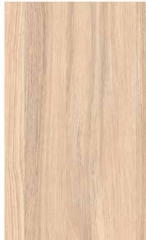
SUFORMA - TIMELESS OAK BISCUIT M6284