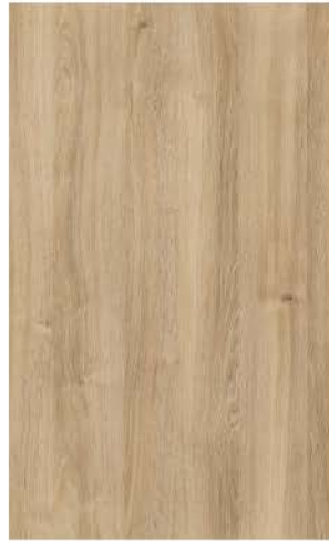
SUFORMA - KARLSTAD OAK NATURAL M6344