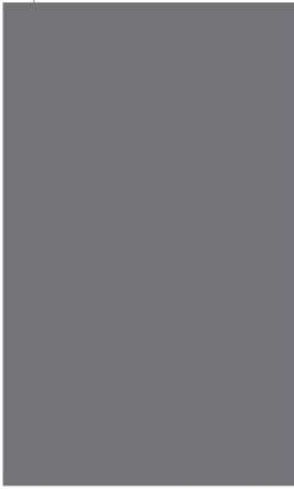
SUFORMA - SILK FUME LS4054