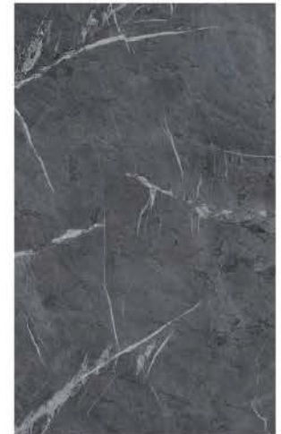
SUFORMA - YIN MARBLE F2272