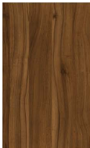
SUFORMA - LYON WALNUT M4462