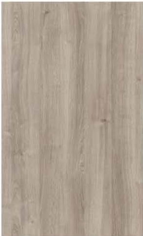
SUFORMA - KARLSTAD OAK GREY M6344