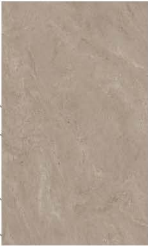
SUFORMA - QUIET STONE F2315