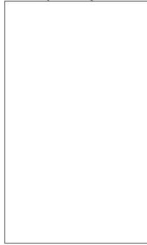
SUFORMA - SILK PURE WHITE BS4401